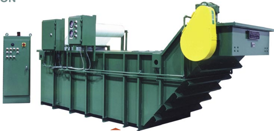
Model LVF4-800 Liquid Vacuum Filter

The Filtertech Liquid Vacuum Filter Model LVF provides effective solids removal through media filtration which is vacuum assisted to minimize media usage and improve filtrate clarity. The filter comes equipped with its own clean and dirty reservoir tanks which minimize floor space requirements.