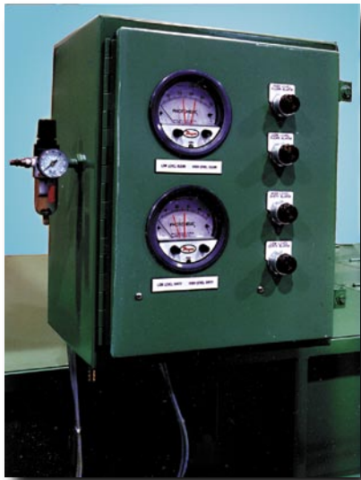
Optional Bubbler System for Continuous Level Control